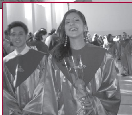
Above: Smiling faces at the 2007 RFS graduation!