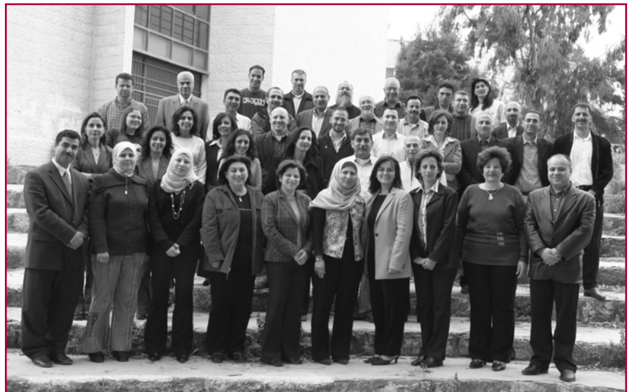
RFS Alumni and Staff Graduates

Finally, I have discovered that patience, perseverance, respect of time and dedication are among the most important things needed to succeed, not only in one's career but in every other aspect of life as well.