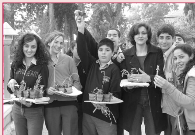
Ninth graders visit the Kaykab Gardens at Friends Boys School.