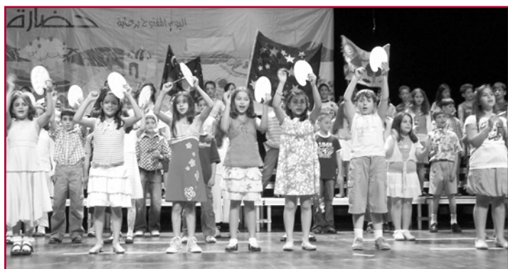
Music day at Friends Girls School